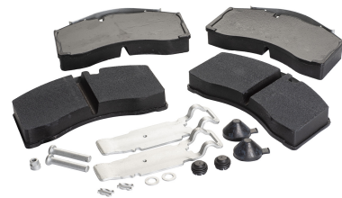
Air Disc Brake Pads - Midland