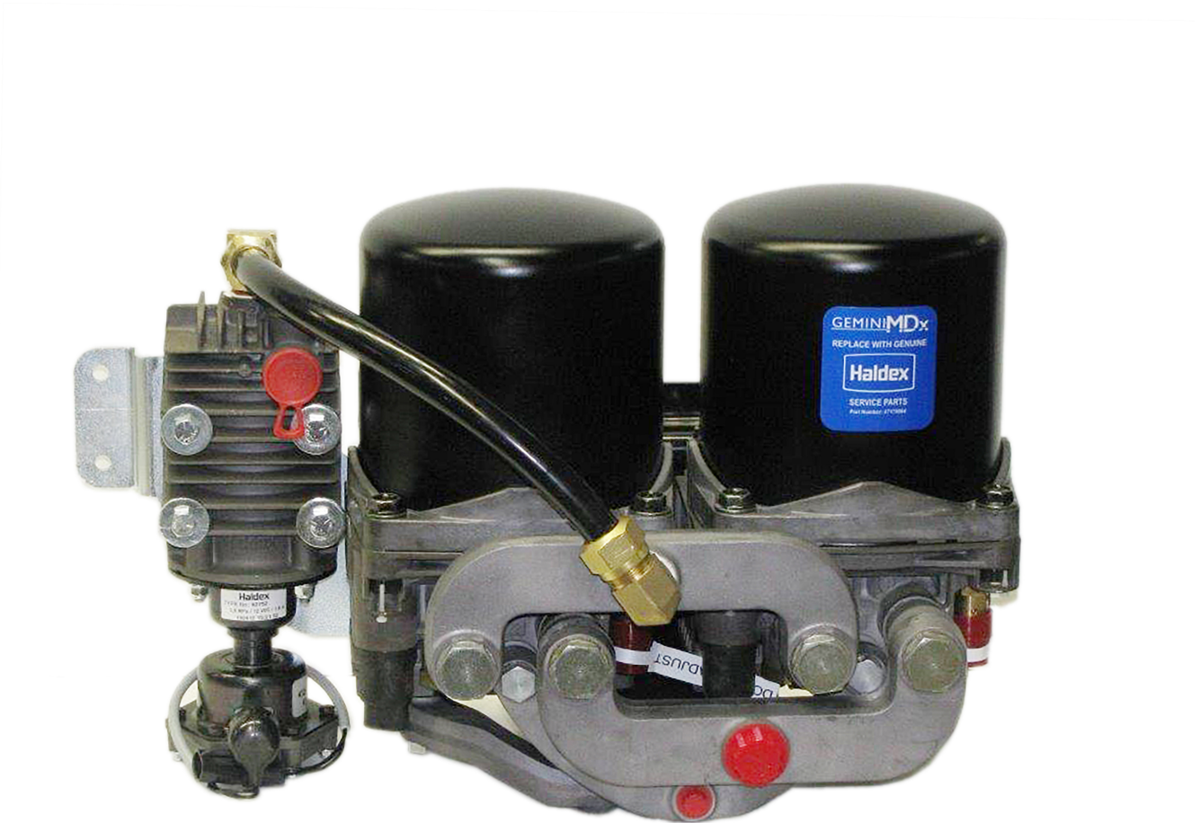
Haldex Air Treatment