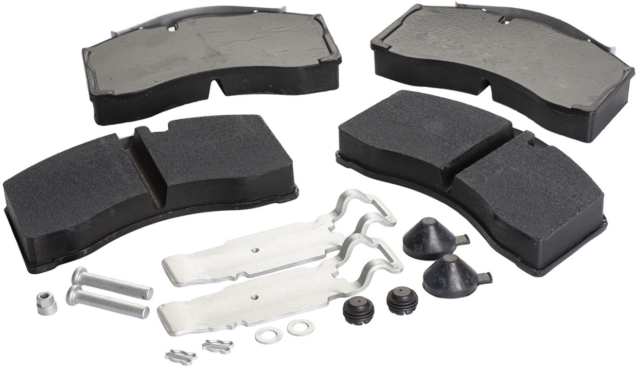
Midland Air Disc Brake Pads