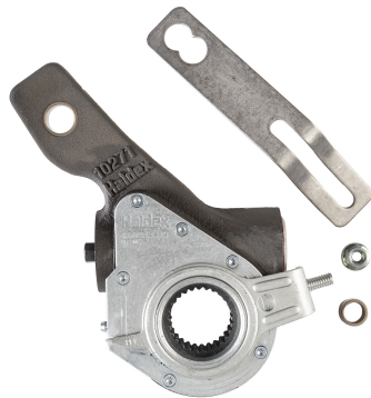
Slack Adjusters - Haldex

Last updated: Monday, 13 May 2024 07:22 PM