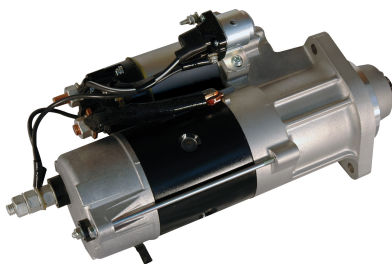
Starters - Mitsubishi Electric/Diamond Gard