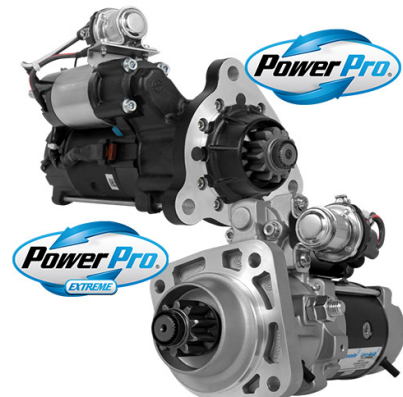
Starters - Leece-Neville

Last updated: Tuesday, 10 October 2023 01:33 PM