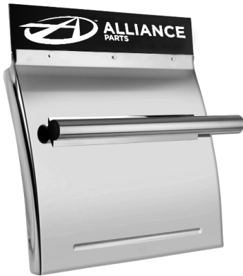
Fenders - Alliance

Suggest the following to your customers for additional sales: